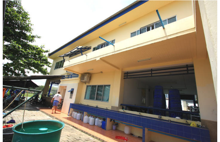
Main building exterior walls