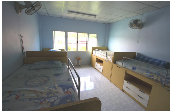
Main building interior walls