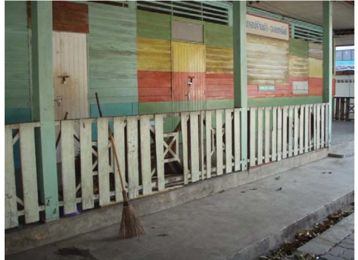
Classrooms needing painting, inside and outside

Estimated Budget for this Project: The sponsor for this project will be Glenn Defense Marine who is the Husbanding contractor for the US Navy in Thailand. The Rotary Club shall provide ladders and tools for cleaning and paint prep. The following is the expected budget for this project. The Rotary Club of Patong Beach and / or IBAP will provide for the lunch.