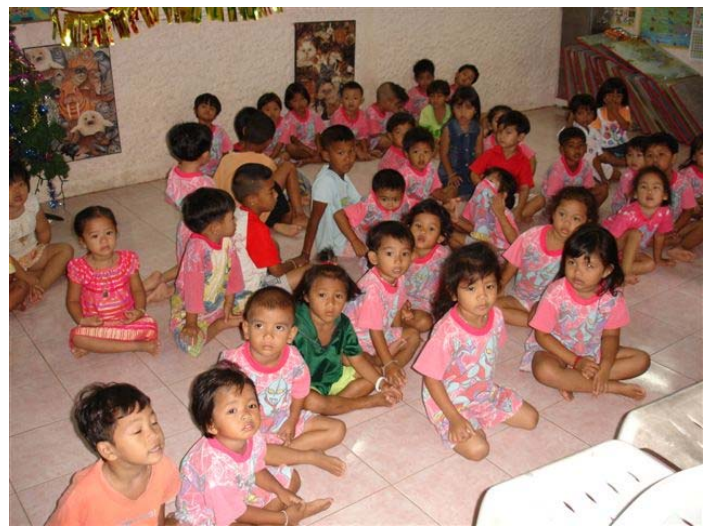
Holland House Child Care Facility in Kathu