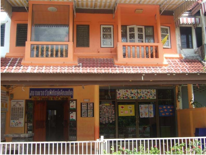
Lower Floor Entrance needs painting

145/2 Rat-u-Thit 200 Pee Rd., Patong Beach sub-district, Kathu district, Phuket Province 83150 THAILAND