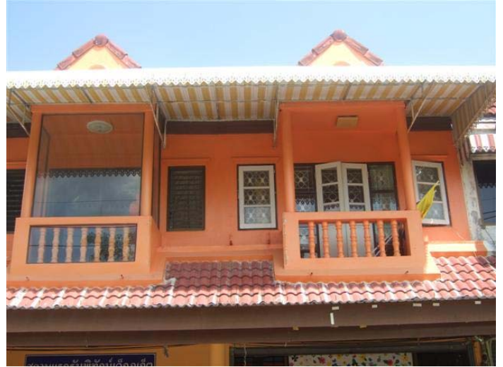
Upper floor building front needs painting – however and unless proper safety scaffolding can be provided we shall not paint this.