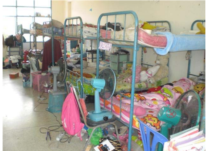
Some more of the beds in the dormitory room. Needing paint.

So with this in mind, what I plan for this COMREL is first of all to show these kids someone cares and sports is a good way to get their lives together. We can paint the beds that are in good order and also then repair others that need so by welding good spare parts together.