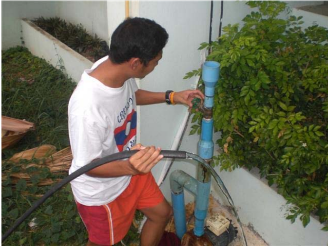
The water pump needs to be primed every time it is used and only needs a foot valve in the water tank.