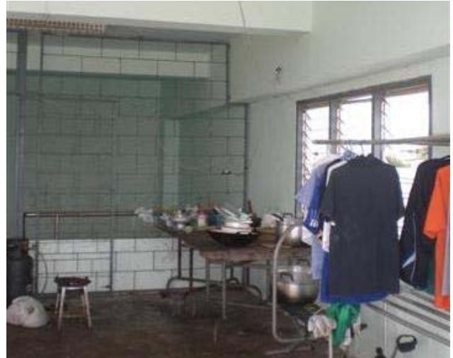
This is the kitchen where food for the 28 kids is cooked.