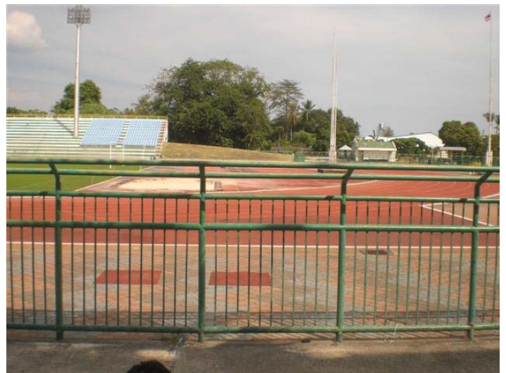
Inside the stadium where the children practice.