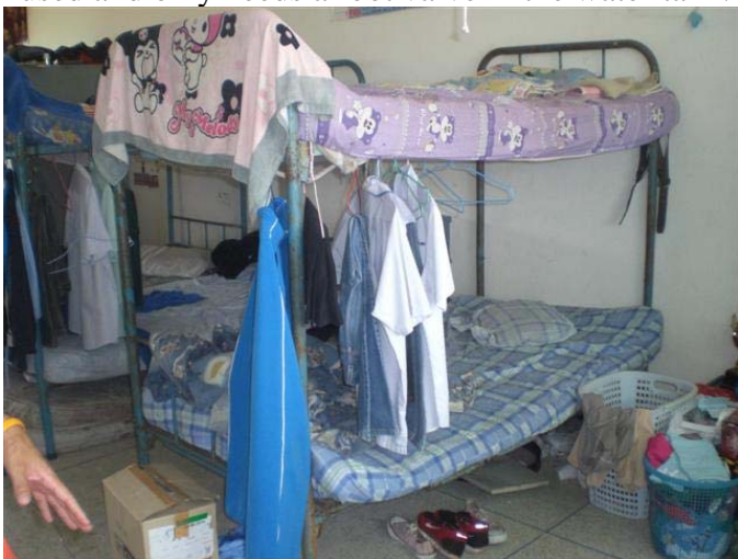
These are some of the current beds at the facility, in need of some welding type repairs and paint.