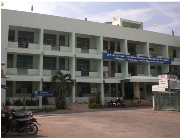
The front of the stadium where the Phuket Sports Club is located.

Again many things to do for this great project and The Rotary Club of Patong Beach wants to make along term commitment for most of these improvements above and will follow up accordingly. Following are some photos of the living quarters for this project: