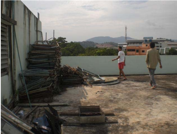
Some additional bed parts on the roof that can hopefully be used to repair other bends via welding.