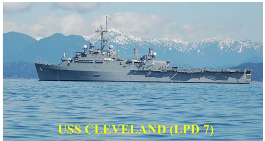
USS CLEVELAND (LPD 7)